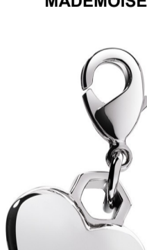
Charm Heart /10.101 ECRIDOR MADMOISELLE Palladium finish