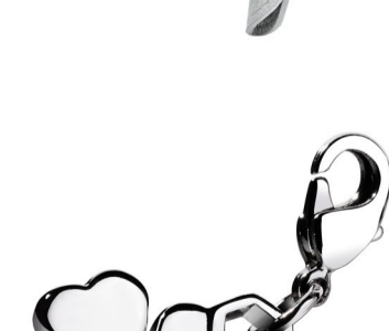
Charm Clover /10.103 ECRIDOR MADMOISELLE Palladium finish