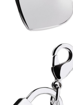
Charm Padlock /10.102 ECRIDOR MADMOISELLE Palladium finish