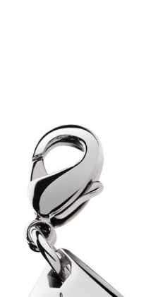
Charm Envelope /10.105 ECRIDOR MADMOISELLE Palladium finish